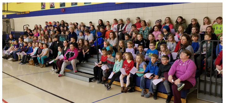
Grades 1 - 5 gathered in gym to learn more about Lent and the Penny Power Lenten project.

The Rite of Christian Initiation for Adults is an extended period of evangelization (developing a relationship with Jesus Christ), catechesis (instruction in the faith), and spiritual formation (deepening in faith) in the Roman Catholic Church. Although it is primarily the process by which people become full members in the Roman Catholic Church, RCIA welcomes serious inquirers at all levels of knowledge, faith and intent--in other words, you do not need to feel like you're ready to become Catholic before you begin RCIA. Ultimately, though, the process culminates in the reception of one or more of the Sacraments of Initiation: Baptism, Confirmation, and Eucharist.