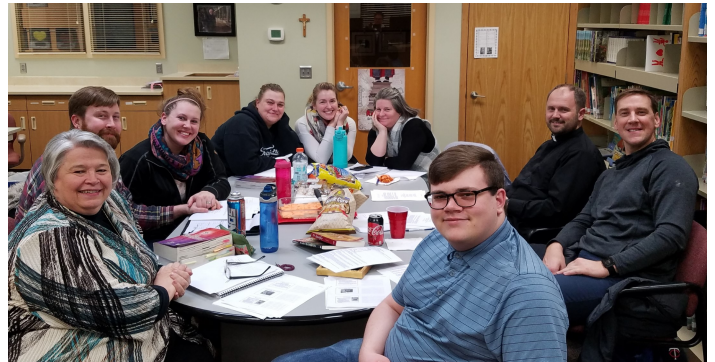
2019 RCIA Candidates

Each catechist participates in a workshop prior to the start of the school year. They are also provided a manual for their grade level and multiple resources in print, video, and online to help them be the best catechist for your children.